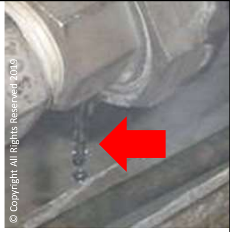
Steam condensate leak flashing to steam, wasting energy and water